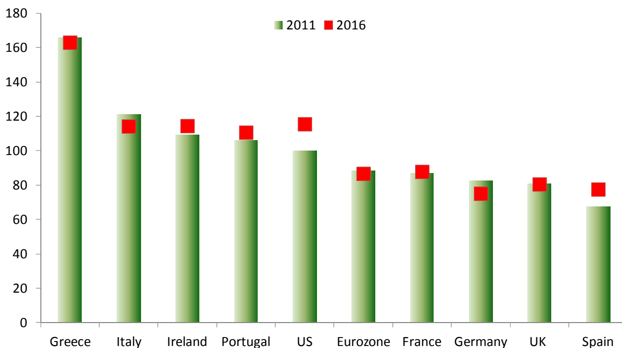
Figure 2. Public debt in selected countries, 2011 and 2016 (% of GDP)

came to haunt all of us as financial markets re-priced sovereign risks. However, budgetary consolidation seems well underway in all 'sinning' countries together with long-awaited structural reforms. As may be seen from Figure 2, based on IMF forecasts to 2016, after increasing in the aftermath of the 2008-09 financial and economic crisis, sovereign debts are now expected to stabilise at manageable ratios to GDP in all of the eurozone countries except Greece - even though slow growth will not allow for rapid reductions. In sum, all available information points to a situation that is coming back under control.